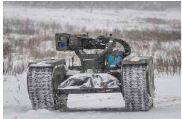
The R600S and the Milrem THEMIS

Like its lighter family members, the R600S is 'plug-and-play' compatible and is easily integrated with battle management systems.